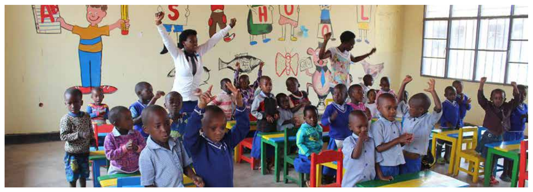
Children having a fun time singing in their classroom at Rwabicuma ECD