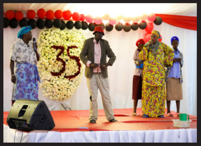
Urunana acting out a sketch on Unpaid Care Work during the 35 years Anniversary Celebration