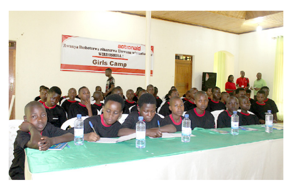
Participants busy taking notes during one of the girls' camp session

Murekatete also pledged to share what she had learned with other girls in her village who weren't able to attend the Girls Camp.