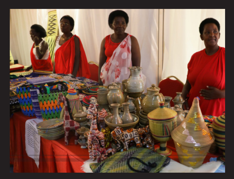
Rightsholders happily display some of their work that generates income for them