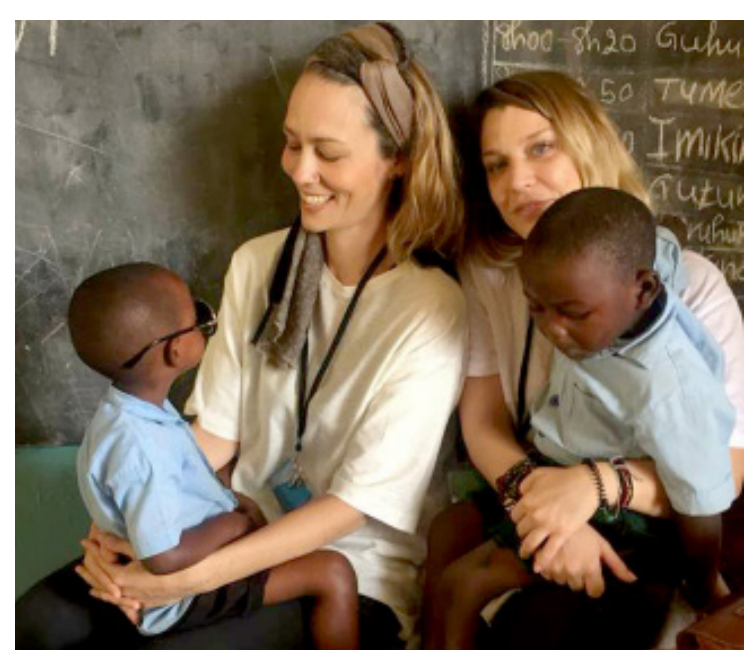
Greek supporters having a light moment with children at one of the ECDs in Gitesi sector