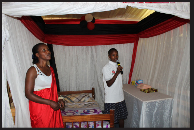
A girl explains to the bystanders how she and others are benefiting from the girls' rooms