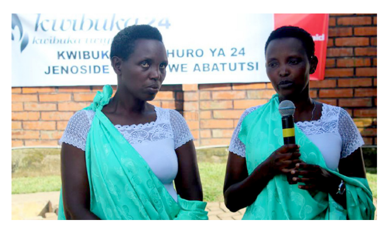
AAR Right holders, also Genocide survivors sharing their testimony during the AAR Kwibuka 24 commemoration vigil