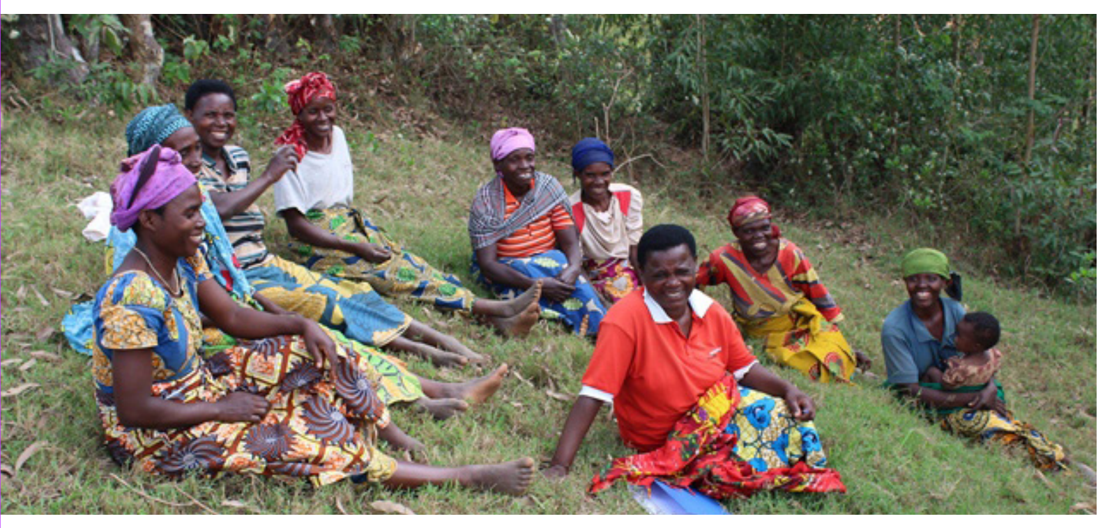
Tuzamurane cooperative members sharing a light moment during one of their meeting sessions

Tuzamurane Cooperative is among cooperatives that have been supported by ActionAid Rwanda in Murundi Sector, Karongi District. The cooperative was supported with livestock and received skills development trainings to improve the livelihood of its 29 members who were living below the poverty line of one dollar a day. AAR also gave trainings on Gender Based Violence prevention, property rights, as well as women's rights.