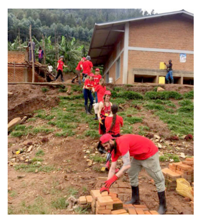
Greek supporters helping with the construction of a school in Muvungu primary school, Gitesi sector

The Greek Volunteers also visited Gitesi ECD where they spent time with the children, played and interacted with them. The children were excited to spend time with the Greece volunteers.