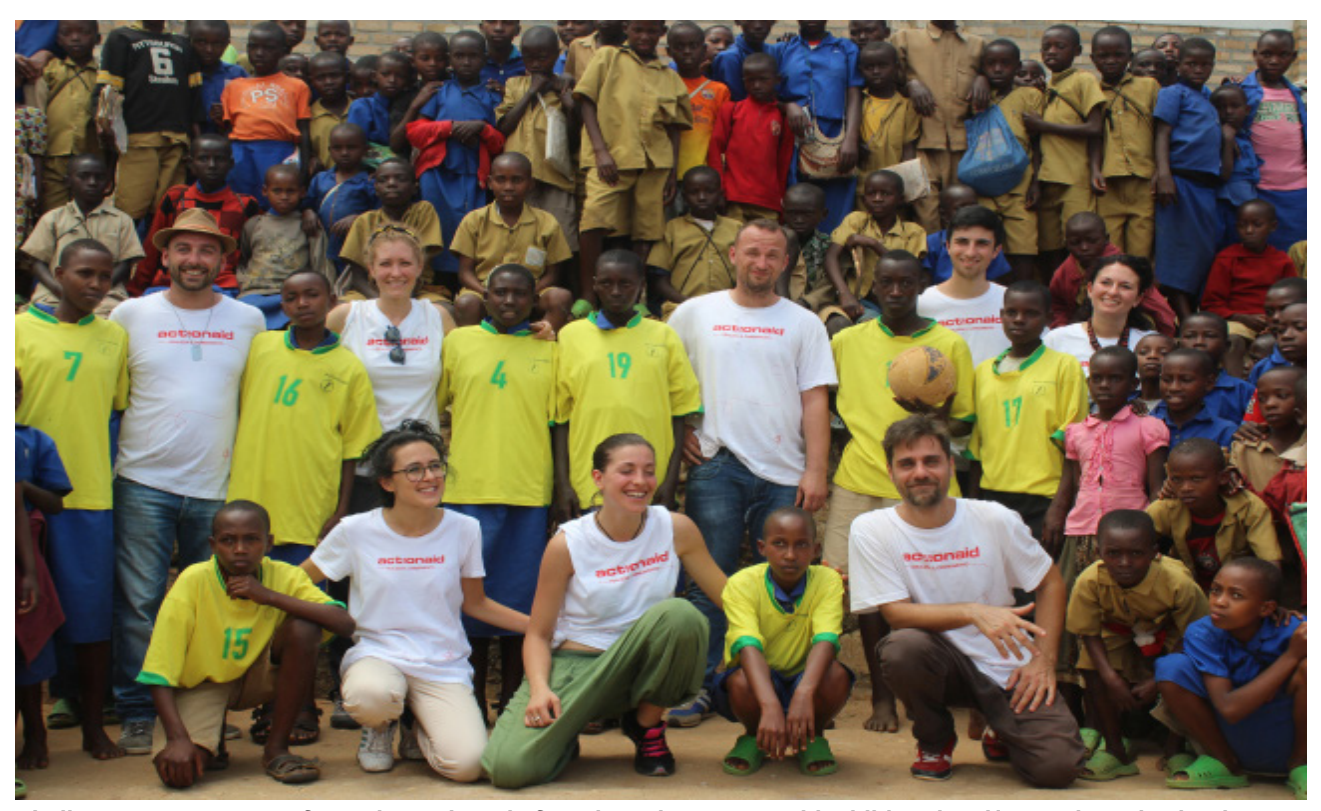
Italian supporters pose for a photo shoot before they play soccer with children in a Nyanza based school

"ActionAid Rwanda is one of the best performers in this district. AAR has greatly improved the area of education in Gisagara district. We now have ECDs built by ActionAid, they have built classrooms, they work hand in hand to support the transformation of the rural woman and girl child. Through their support; children are able to attend school and now we have the lowest rate of dropouts in the district than we have ever had. We truly appreciate the work they do here and in the other districts they operate," Gasengayire emphasized.