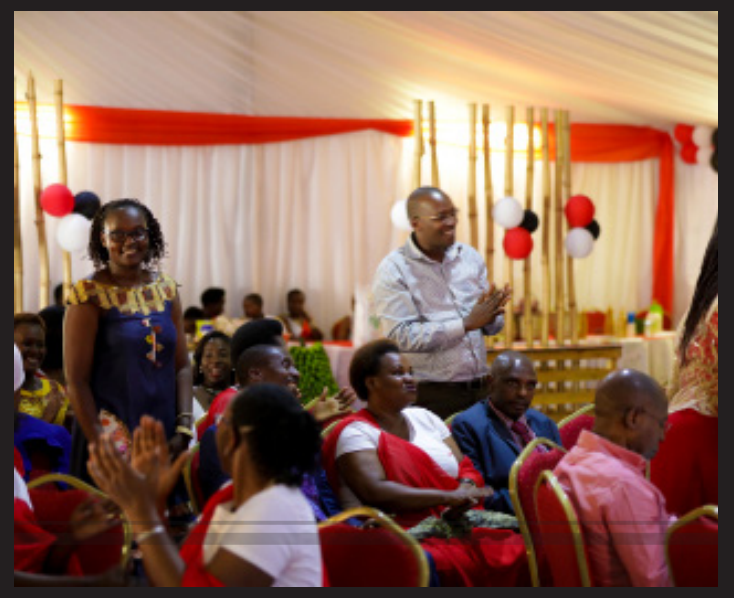
Former AA Rwanda staff standing up for appreciation of their contribution