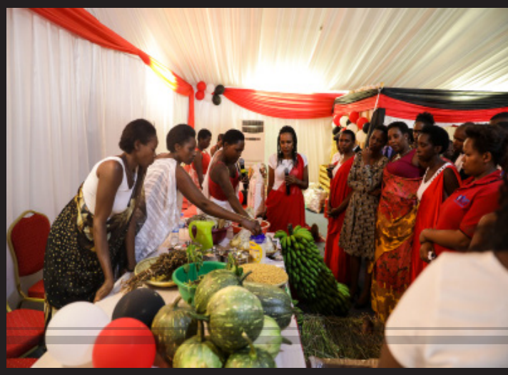
Rightsholders exhibiting some of their work to the visitors at the 35 years event