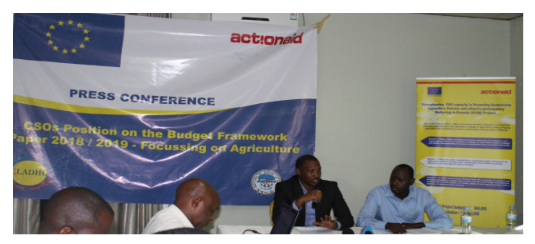
Sekanyange, the Civil Society Platform & CLADHO Chair person addressing the media during the Press conference

Civil Society organisations also called for transformation of milk collection hubs to act as one stop center for farmers to acquire services such as animal vaccines, animal drugs and fertilizers.