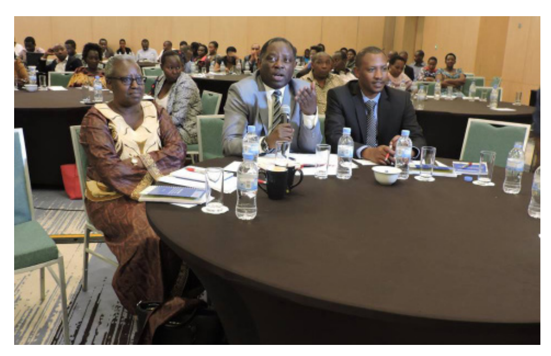
Minister Nsengiyumva (in the middle) sharing his views during the public dialogue

feedback to national institutions which gives them the opportunity to adjust their programs to better suit farmer's needs.