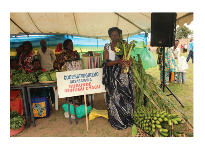
atwigireho Cooperative showcasing some of their agricultural products