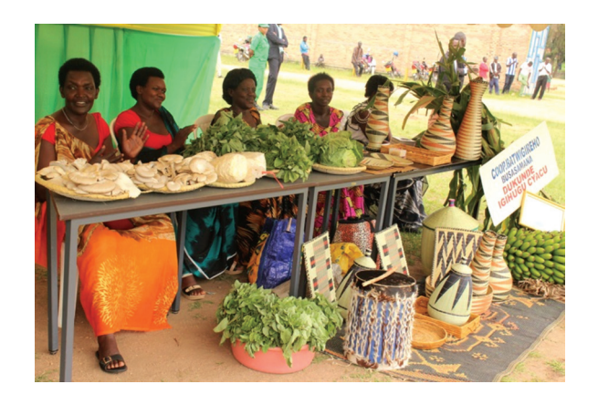
Rural women farmers exhibiting their agricultural products during IWD celebrations