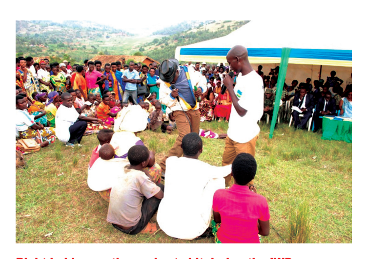
Right holders acting a short skit during the IWD Wcelebration in Gisagara LRP