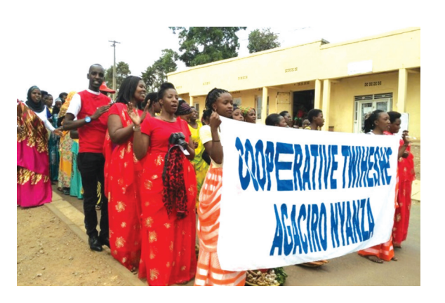
AAR Staff & Partners matching and singing during IWD in Nyanza LRP