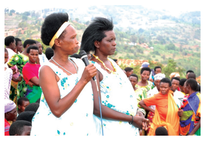
A right holder sharing her testimony on how she was empowered by AAR