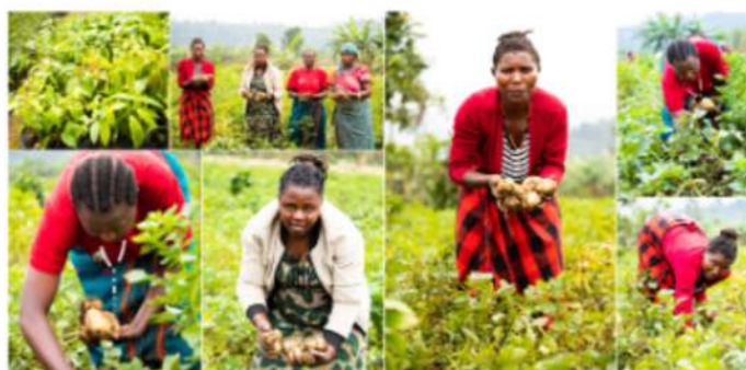
Women farmers from Muko, Musanze District, working in their potato farms with the support of the TIF Project