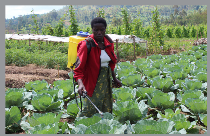
A right holder under the IFS MUKO project watering her vegetables