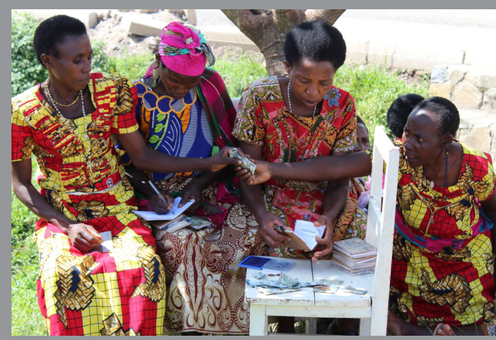
Women in Muko sector based cooperative during the weekly savings activity