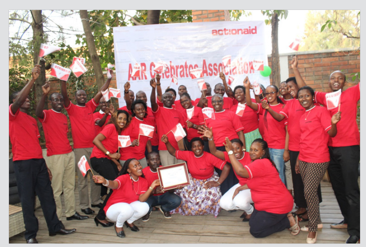
AAR staff raise flags during the celebration

ActionAid, Rwanda recently moved from being a Country Program to an Associate and is now a member of the ActionAid Federation. This milestone achievement was announced on 23-06-2016 during the Annual Directors' Forum & General Assembly in Maputo.