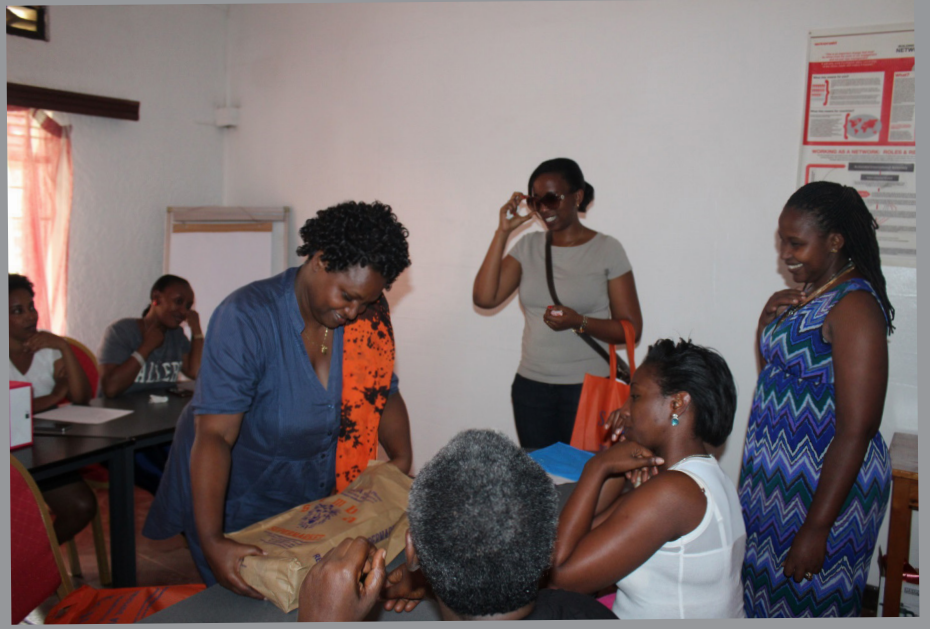
Some of the AAR Women Forum members cheerfully exchanging gifts