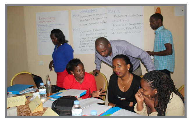
AAR staff during a group discussion at the Inception launch

AAR has worked on a similar project before known as Public financing for Agriculture(PFA) meant to advocate for increased investment for agriculture whereas SCAB builds the capacity of CSOs to participate in agriculture budget planning process to eventually influence agriculture policy shaping or advocate for policy changes.