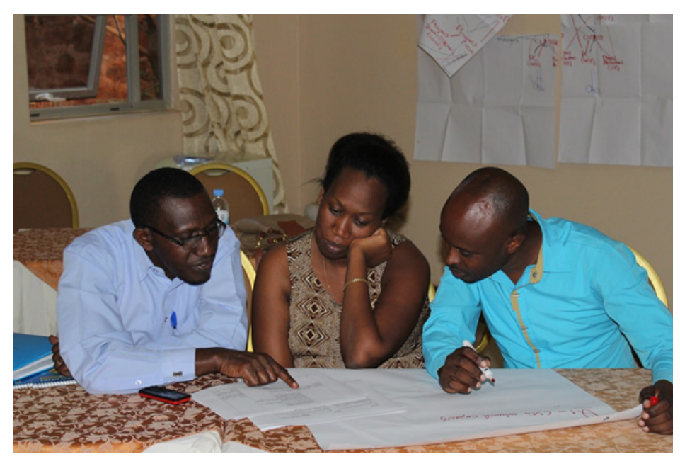
SCAB/EU staff and partners during a group discussion at the inception launch

Strengthening CSO in Agriculture Policy and participatory Budgeting (SCAB) project Funded by the European Union is a new project that will be implemented by ActionAid International Rwanda together with its partners CCOAIB and CLADHO. This is a capacity building project targeting Civil Society Organizations(CSOs)& Community Based Organizations(CBOs) that are in agriculture to participate in agriculture policy shaping, implementation, monitoring and evaluation and advocate for changes where necessary.